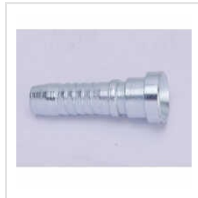
12inch Unf Straight Nipple