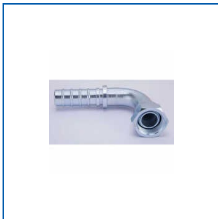
12INCH MILD STEEL HYDRAULIC BEND