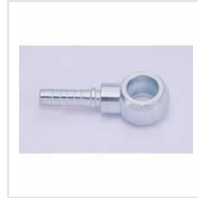
Stainless Steel High Pressure Banjo