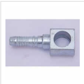
Ms Square Banjo