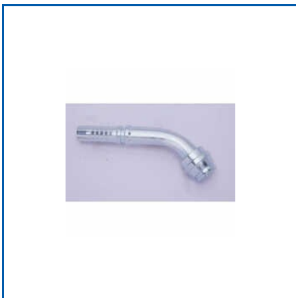
MILD STEEL HYDRAULIC BEND

10mm BSP Adapter, 12Inch Mild Steel Hydraulic Bend, 12inch Cold Forging Cap, 12inch Unf Straight Nipple, 1inch Mild Steel Hydraulic Bend, 1inch Stainless Steel Straight Nipple, 2inch Stainless Steel Hydraulic Cap, Adapter Hex Nipple, Hex Cold Forging Nut, Hydraulic Cap, Hydraulic Hose End Fittings, Hydraulic Nut Crimping Nipple, Hydraulic Support Hex Crimping Straight Nipple, Mild Steel BSP Bend, Mild Steel Hydraulic Bend, etc.