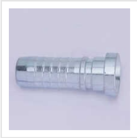
Stainless Steel Straight Nipple