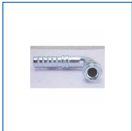
1INCH MILD STEEL HYDRAULIC BEND