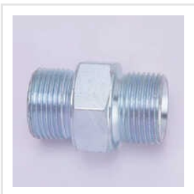
Adapter Hex Nipple