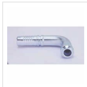
Mild Steel BSP Bend