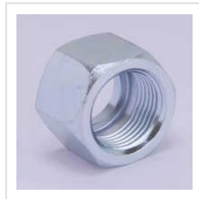
Stainless Steel Hydraulic Nut