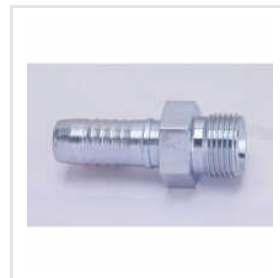
Stainless Steel Male Connector