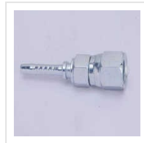
Stainless Steel Swaged Nipple