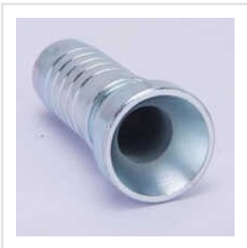
1inch Stainless Steel Straight Nipple