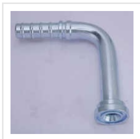
Sae Flange Long Bend