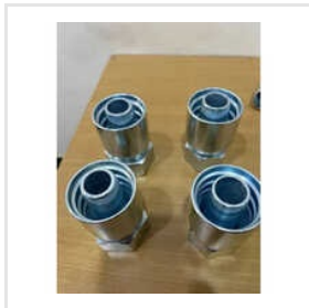
One Piece Crimping Type Hydraulic Fittings