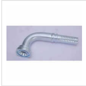
Sae Flange Bend